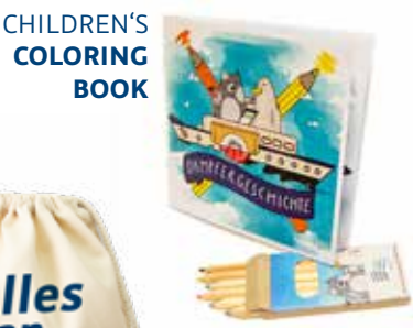
CHILDREN'S COLORING BOOK